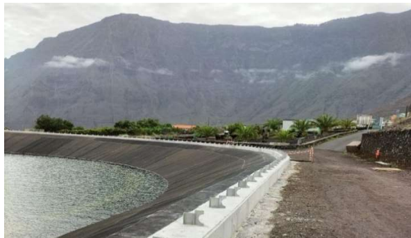
Completed basin lining prior to fabric cover installation

ABG assisted with the product specification, export and shipping of the Pozidrain rolls to the remote El Hierro island location.