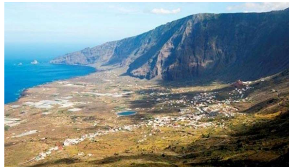
Aerial of the El Golfo basin on El Hierro in the Canary Islands

Pozidrain installed to line the base of the reservoir with cusps and upper geotextile facing upwards to channel and detect any leakages in the primary EPDM waterproofing. The underside of the core is impermeable and joined with a selvedge overlap.