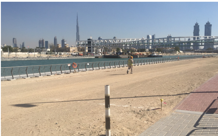
ABG Salt Barrier installed underneath landscaping running along the side of the canal

ABG offered assistance with cost comparisons, drawings and installation advice. ABG Manufactured and shipped from the UK to meet a tight deadline