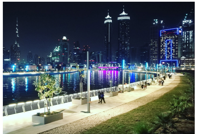
Salt Break prevents the salty moisture from the canal from damaging the planted areas along the canal walkways