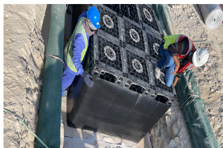
Rootline being wrapped directly around the structural tree pit modules