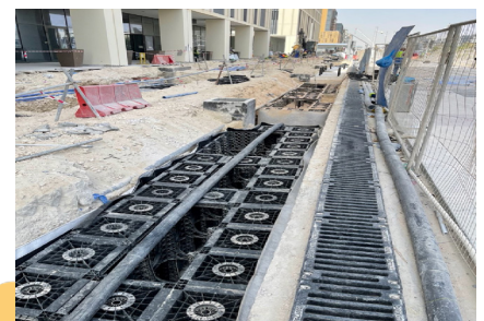
Salt Break barrier lines the soil containment modules as part of the sub-surface irrigation system

Contact ABG today to discuss your project specific requirements and discover how our past experience and innovative products can help.