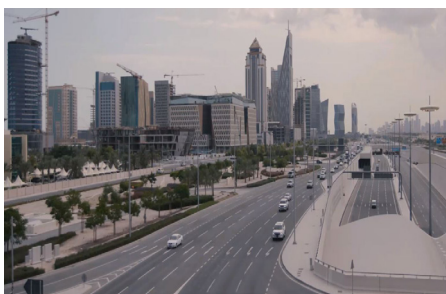
Tree-lined walkways in Lusail

Specification advice was provided to our Middle East distribution partners Burden World Trading W.L.L.