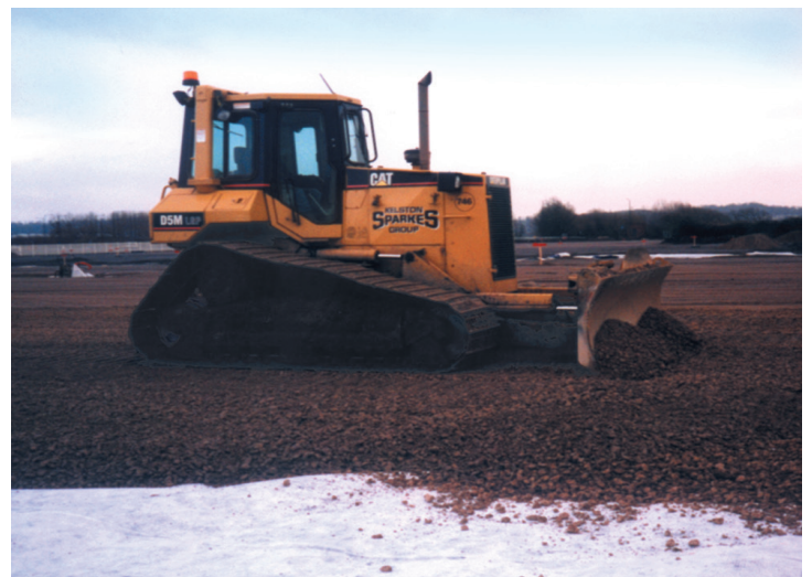
Plant operating on 150mm of Type 1 backfill material