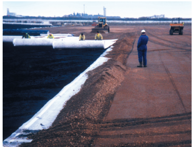
Large rolls enabled rapid installation

ABG provided technical advice and design assistance on this project. This included supervision during the installation and liaison with the Environment Agency.