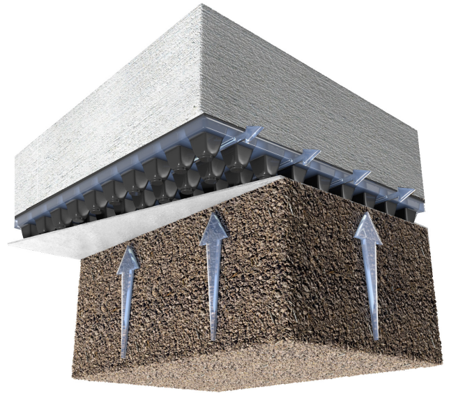
Fig. 1: Deckdrain Reservoir Base Drainage cut-away diagram

Deckdrain is supplied in rolls packed in an opaque plastic bag for protection against UV light. The bags should not be removed until required and once laid the Deckdrain should be covered within 28 days. The rolls should be stored on a flat dry surface and covered with a light proof tarpaulin. Individual rolls weigh approx. 48-58kg and are approximately 1.1 - 2.2m wide. They should not be dragged across surfaces. (Fig. 3). The formation should be well graded and compacted, with no roots or sharp objects and no undulations greater than 50mm.