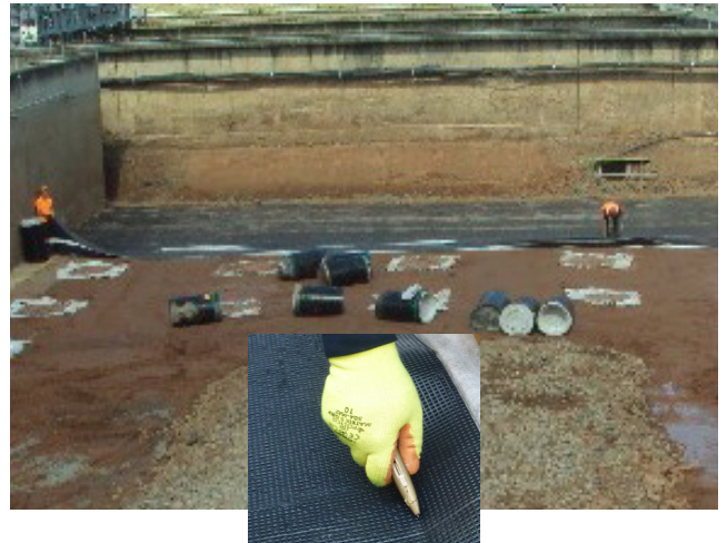
Fig. 4: Rolls laid in line with direction of the main flow and cut with a safety knife to suit edge details

Place the concrete with care, making sure that the composite is not dislodged during the pouring operation and so that concrete is not allowed to enter the open core under the stop-end ( Fig. 7 ).