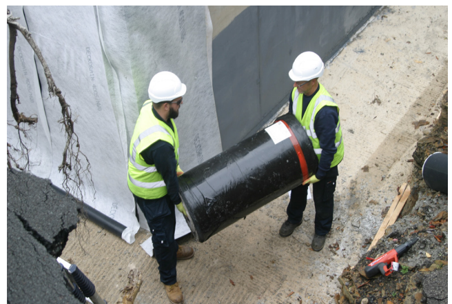
Fig. 3: Rolls are easy to carry / transport across site