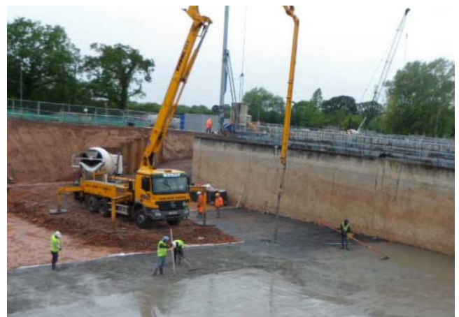
Fig. 2: Concrete pour over the Deckdrain