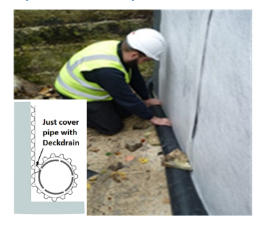
Fig 5: Wrap pipe to just cover pipe and weight down