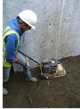
Fig 10: Shovel soil to level and use vibrating plate next to Deckdrain