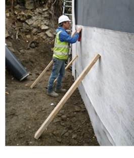
Fig 8: Place second layer and ensure flaps overlap horizontally and vertically