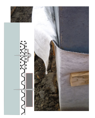
Fig 11: 300 mm textile tucked behind Deckdrain and overlapped