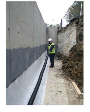
Fig 7: Roll out and cut Deckdrain with sharp knife