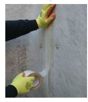
Fig 6: Seal flaps with ABG jointing tape