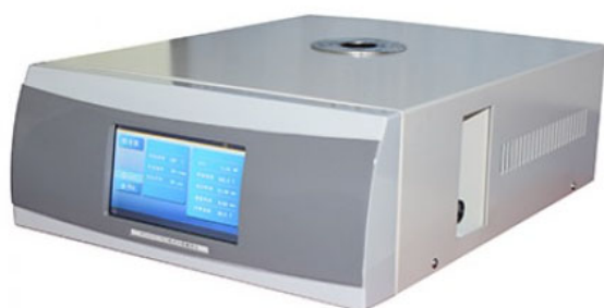
Figure 2: Differential Scanning Calorimeter (DSC) OIT test equipment to ASTM D 3895-14

The first ASTM test method for Oxidative Induction Time (OIT) was ASTM D 3895-14: Test Method for Oxidative-Induction Time of Polyolefins by Differential Scanning Calorimetry (DSC) ( Figure 2 ). A small sample of the material to be tested is placed in the apparatus which measures heat and energy extremely accurately. The apparatus heats the sample to 200°C and at the appropriate time, oxygen is introduced into the system and the sample begins to oxidise.