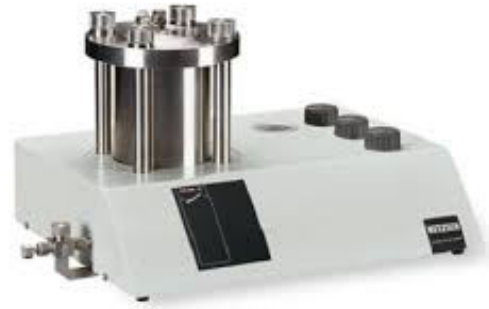
Figure 4: High Pressure Differential Scanning Calorimeter (HP-DSC) to ASTM D5885-06D

The HALS stabilisers required a new test method; one that operated at lower temperature. By increasing the pressure to 3.4MPa and reducing the temperature (150°) within the test vessel, a similarly aggressive environment was created (Gay Lussac's Law P_1T_1 = P_2T_2 where T is in Kelvin). This resulted in the ASTM D 5885 - 06 (2012) Test Method for Oxidative Induction Time of Polyolefin Geosynthetics by High-Pressure Differential Scanning Calorimetry (HP-DSC) or HPOIT ( Figure 4 ).