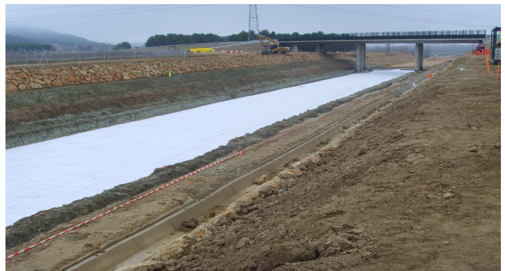
Wide width rolls allowed rapid installation to meet challenging project timescales