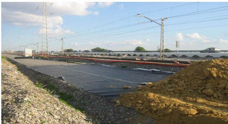
Embankment fill being installed on Pozidrain