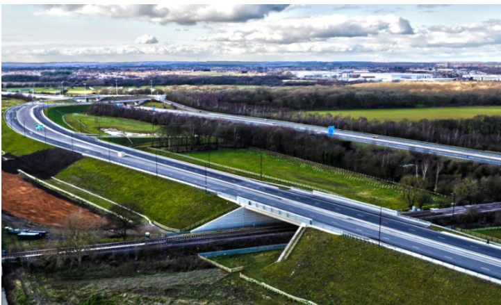
Finished stable, drained and consolidated embankment