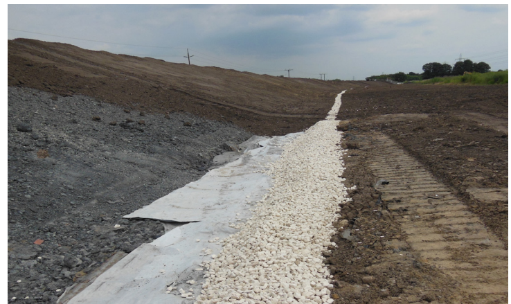
Finished embankment profile with Fildrain tucked into perimeter drain