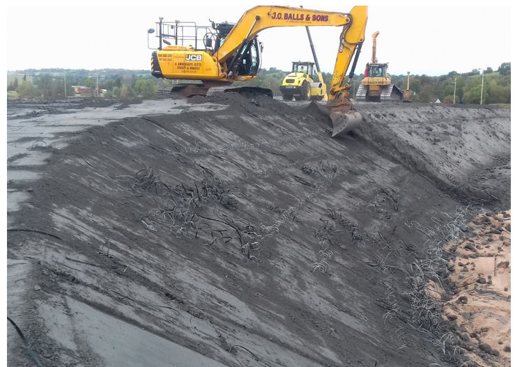
Composite root structure supporting healthy and sustainable vegetation