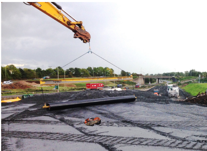
Early retention of soil and seeds encouraging early germination