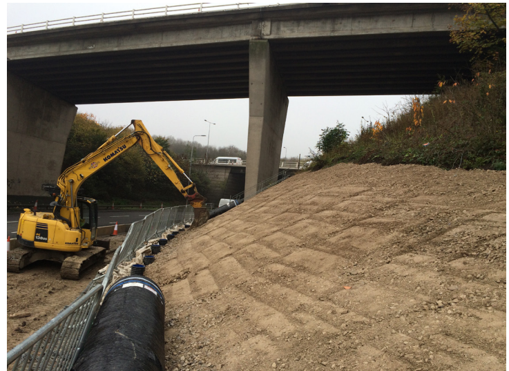
Grading of batters ready to receive Erosamat

ABG provided specification and design support to aid the approval process. Erosamat is manufactured and stocked at our production facility in West Yorkshire which enabled ABG to meet strict delivery requirements.