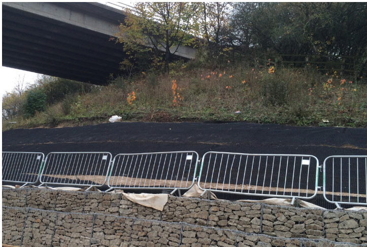
Early retention of soil and seeds encouraging early germination