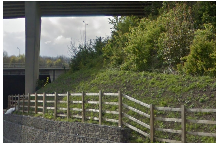
Composite root structure supporting healthy and sustainable vegetation