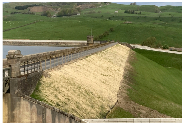
Vegetation beginning to re-establish