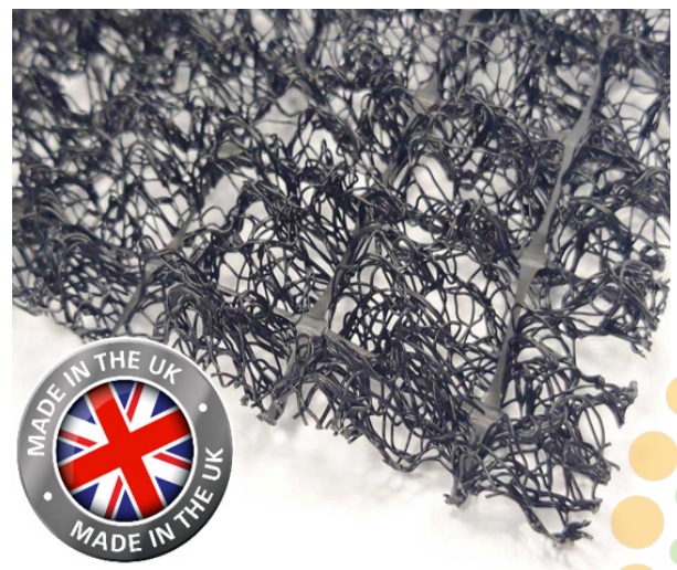
ABG Erosamat 3/20Z 500M