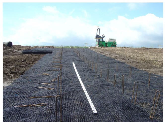
Correct surface preparation and pinning are essential to maintain good surface contact with the underlying soil followed by careful seeding and filling.

as an open mat under CIRIA Report 116, 'Design of Reinforced Grass Spillways', Erosamat provides a permanent and effective surface erosion control and vegetative root reinforcement layer. The intention was to complete construction in early summer allowing time for establishment of fully vegetated slope. However, delays in construction meant vegetation was not fully established by winter 2013/14. Prolonged heavy rainfall led to extensive flooding. The new flood defence measures worked well with no significant loss of soil due to erosion. Independent data collected by Black and Veatch during the 62 day flood reported the spillway and TRM functioned as intended. This data demonstrated that unvegetated Erosamat Type 3/20Z 500M provided sufficient protection to the spillway for velocities exceeding 4 m/s over prolonged periods. Fully vegetated, Erosamat 3/20Z 500M is capable of hydraulic loadings in excess of 6 m/s.