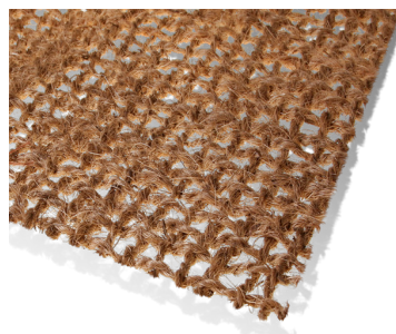
ABG Erosamat Type 2