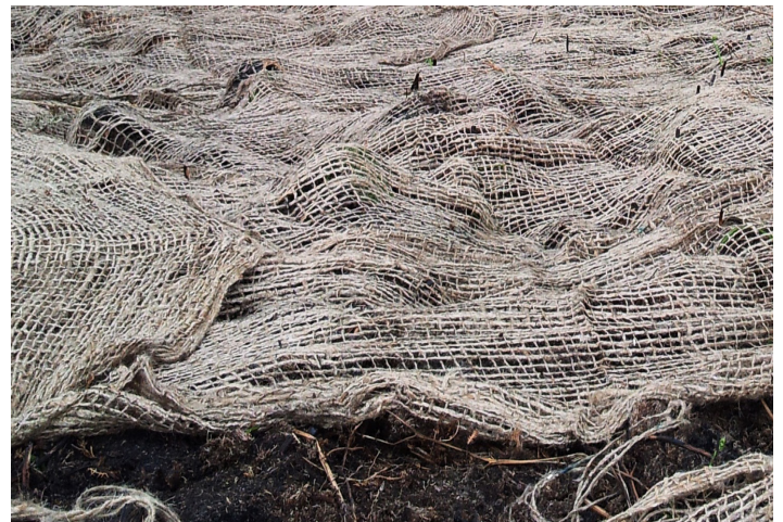
Matting pinned closely to the surface to prevent erosion