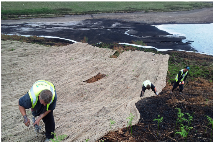
Quick deployment over burnt areas of hillside

The lower slopes of the burnt hillside were covered with the Erosamat Type 1 to prevent downslope contaminated silt erosion. The still vegetated lower slope (not burnt) uses the natural vegetation to stabilise the soil. A longer lasting combination of a surface strip of Erosamat Type 2 with a silt fence provided the final safety barrier above the reservoir.