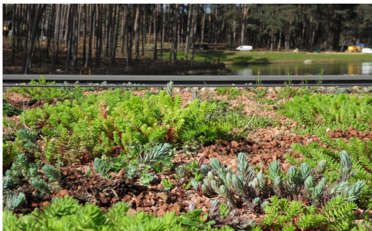
Mature sedum plants following a maintenance visit from Geogreen