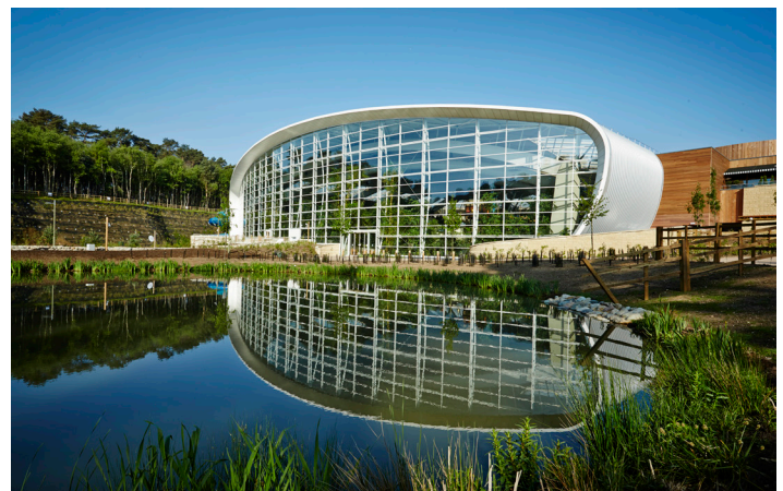
The Woburn Center Parcs main hall and water sports centre