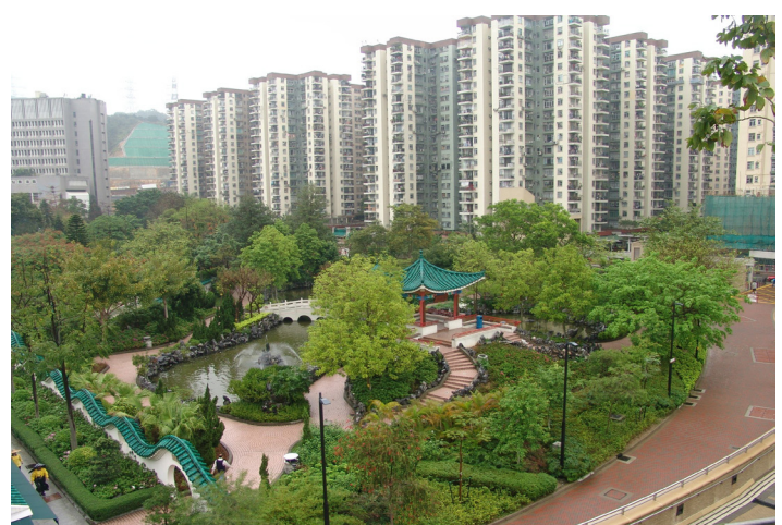
Mei Foo Station integrated into Lai Chi Kok park