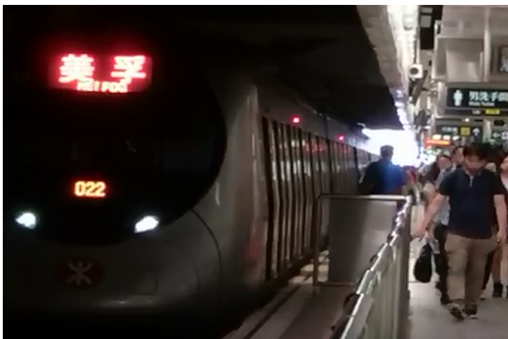
Mei Foo Station beneath the sound proofed Green Roof

Deckdrain receiving cover layer up to 3m in depth prior to hard and soft landscaping, planting with trees and installation of play areas