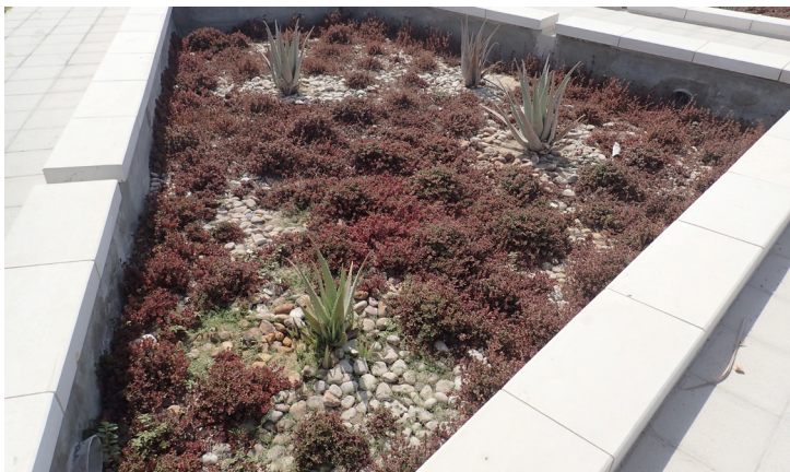
Hardy plants on Roofdrain water reservoir

Roofdrain geocomposite combined three previously separate components into one minimising installation time