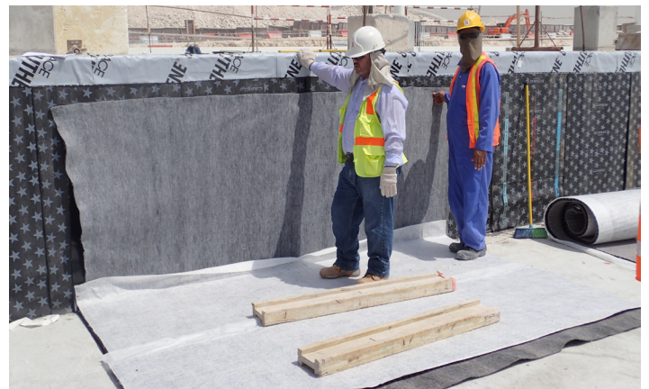
Roofdrain overlap detailing