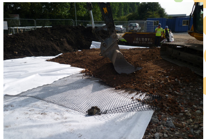
Endorsement from excavator driver. "Amazing!"