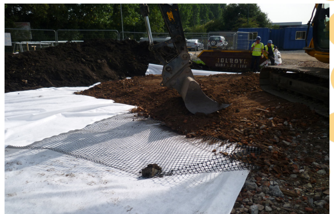
Terrex geotextile and Abgrid geogrid supporting 6F2 hardcore over soft ground