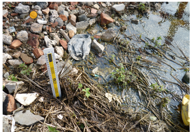
6F2 hardcore was punched into soft and wet weak ground and was lost