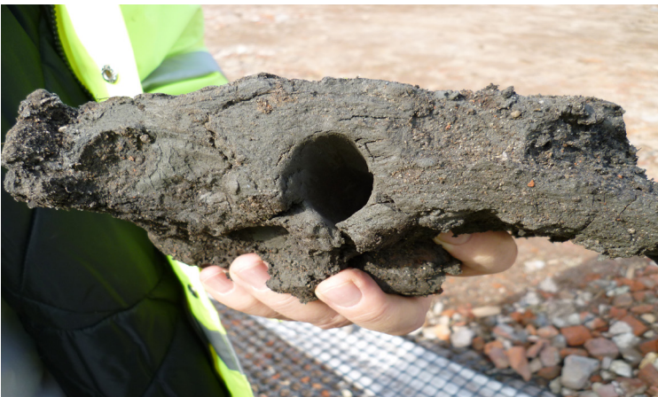
Soft clay ground of 2% CBR was easily deformed by thumb pressure

ABG provided full technical support, including design and installation advice.