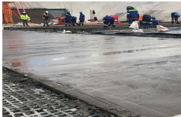
Screed cast into the Leakdrain cusps beneath HDPE slip and water stop channel layers.

Contact ABG today to discuss your project specific requirements and discover how our past experience and innovative products can help.