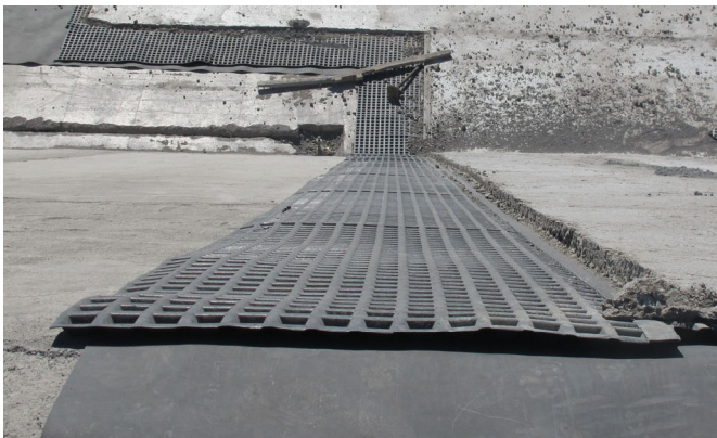
Leakdrain providing the void space and additional protection barrier above the secondary HDPE liner.

The ABG Leakdrain S20U sheet was manufactured with a 100mm selvedge for on-site extrusion welding to create a low permeability barrier. Permeability and leakage volume calculations were provided plus design assistance, installation guidance and additional MQC production checks.