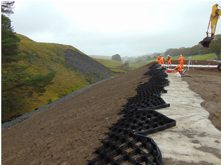
Erosaweb panels providing soil veneer reinforcement