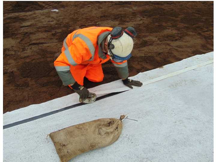
Flat selvedge for rapid overlapping and jointing