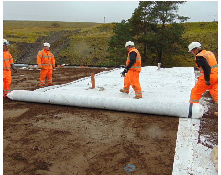
Wide width rolls enabled rapid installation and minimised the number of joints

ABG provided design assistance, including slope stability and flow capacity calculations.