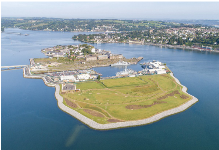
Completed restoration project