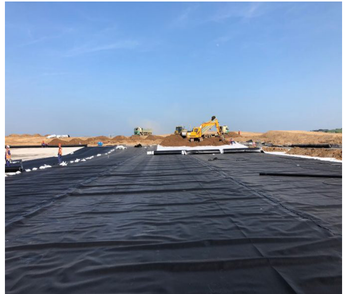
Large Pozidrain geocomposite rolls enabled rapid installation and excellent drainage performance

ABG provided design assistance, slope stability calculations and delivered materials to site.