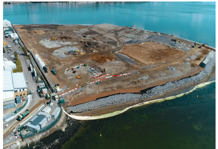
Pozidrain geocomposite drainage installation