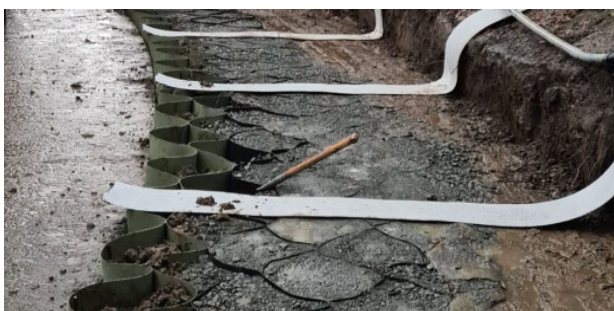
Fildrain drainage geocomposite strips positioned at 1m intervals from the back of the wall

Contact ABG today to discuss your project specific requirements and discover how our past experience and innovative products can help.