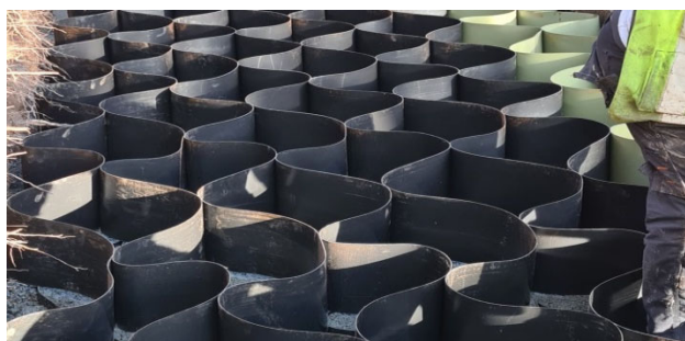
Type C Webwall panels expanded and pinned into position within the excavated footing