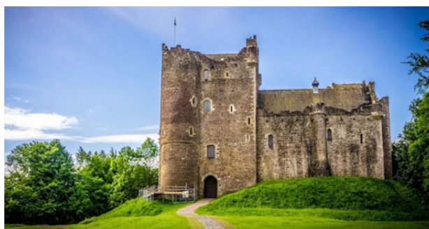
The 13 th century Doune castle in woodland setting