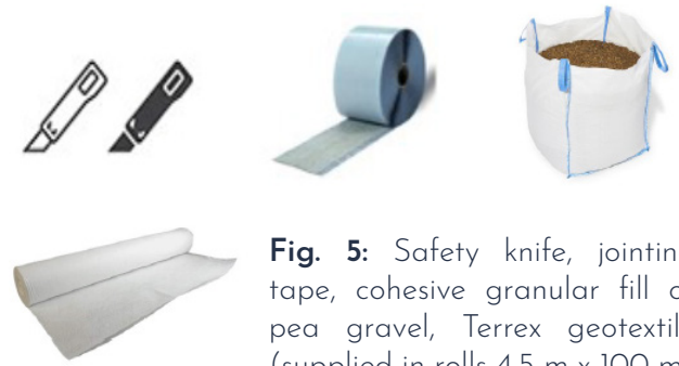
Fig. 5: Safety knife, jointing tape, cohesive granular fill or pea gravel, Terrex geotextile (supplied in rolls 4.5 m x 100 m)