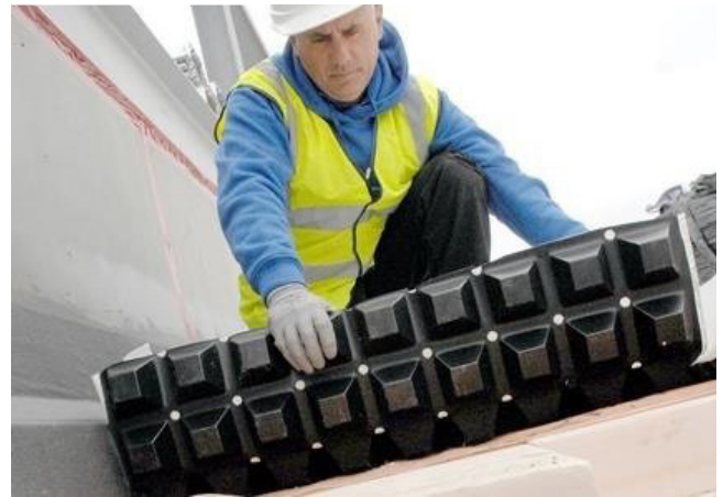
Fig. 6: Lay with geotextile filter & cusplate openings facing up.

ABG Roofdrain is laid with the cusplate openings facing upwards (with the holes in the core at the top), ready to be filled with suitable stone or pea gravel. ( Fig. 6 ). In choosing the starting point and direction of laying, consider the intended access route for placing the infill material and growing media to avoid unnecessary trafficking over the ABG Roofdrain .