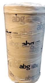
Fig. 3: ABG Roofdrain 60S+RX is supplied in a UV light-proof wrap, to be removed just before installation. Packaged rolls are 0.92m tall x 0.9m diameter, weight approx. 31kg.