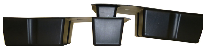
Fig. 8: Interlocking method

For hard landscaping applications, adjoining panels should be interlocked as shown in Fig. 8 . The left hand edge of each panel has smaller cups that slot into the right hand edge. They are designed to overlap, so that when the core is infilled they remain fixed together. When fitting rolls end to end, the cusplates can be interlocked in the same way, or butted together and taped as described in step 2.