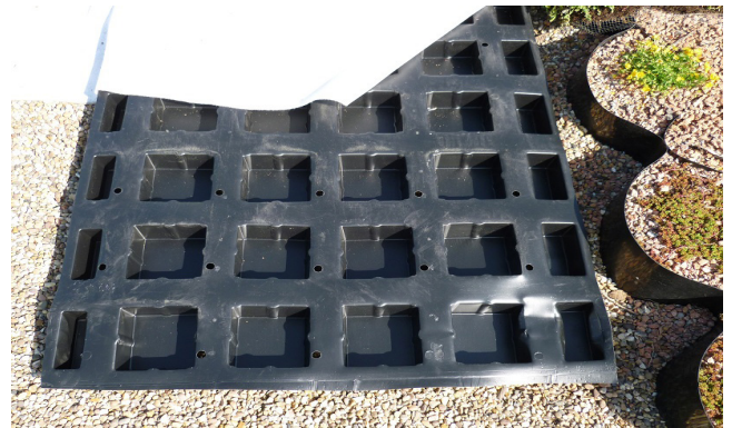
Fig. 1: ABG Roofdrain 60S+RX roof drainage geocomposite. To be filled with lightweight aggregate prior to over-laying with ABG Terrex filter geotextile layer (supplied separately).

ABG Roofdrain can be carried or rolled, but should not be dragged. The packaged rolls are 0.92m tall by 0.9m diameter & weigh approx. 31kg. Unrolled, the product dimensions are 60mm tall x 0.92m wide x 15.2m long.