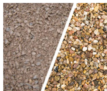
Fig. 9: Cohesive granular fill for hard landscaping (left) or 10mm pea gravel for planted areas (right)

When infilling the cusplates, for hard landscaping areas we recommend a lightly compacted cohesive granular fill, or for planted soft landscaped areas using a 10mm pea gravel. ( Fig. 9 ).