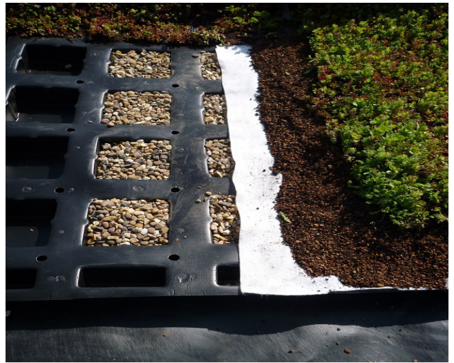
Fig. 10: Infill with stone or gravel before covering with a filter geotextile and growing media for planted areas.

The assessment of suitable safety factors in relation to each particular project must always remain the responsibility of the design engineer.