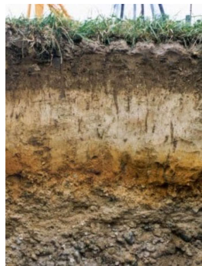
Figure 1: Stratified Soil

As soils are so varied it is very difficult to give precise values for the permeability of a given soil without undertaking site specific tests. In the absence of site specific tests ABG typically uses the Handbook of Geotechnical Investigation & Design Tables (Look, 2007). This information has been combined into Table 1, below, which includes equivalent rainfall rates to allow a better understanding of the sort of water flow rates that the various values of permeability correspond to.