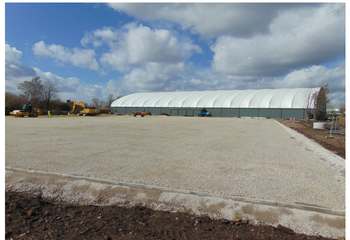
The completed pitch formation prior to the 4G surface installation

ABG provided design assistance and efficient supply of the Pozidrain product for the project.