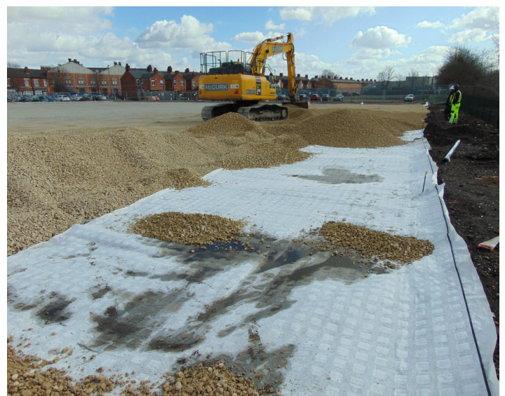
Cover stone being placed onto ABG Pozidrain G4SD layer