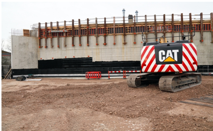
Roll of Deckdrain ready for next horizontal lift with no delay or interference with backfill operation

Deckdrain wrapped around perforated pipe feeding water directly into the pipe. Geotextile prevents backfill clogging inlet holes.