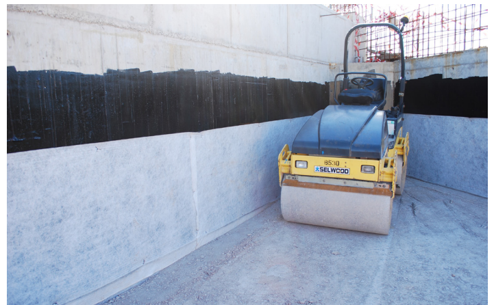
Deckdrain allows compaction close to the structure and provides protection to the waterproof coating