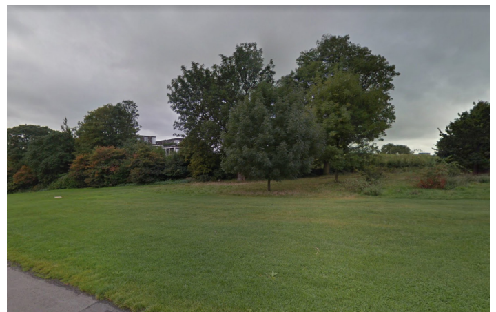
Barrow Hill reservoir blends in with the adjacent Primrose Hill Park