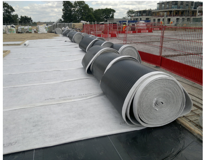
Small rolls of Deckdrain are quickly laid directly on the waterproofing on the concrete roof slab and walls.

ABG provided design advice and technical assistance during installation.