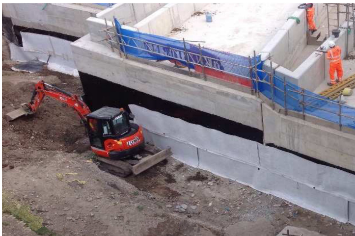
Deckdrain replaces concrete block drainage in tight work space

Deckdrain is easily cut and attached to the existing brick bridge to protect and drain the front face. The geocomposite has the dual functions of drainage to the existing structure and vibration control between the old and new arched bridges.