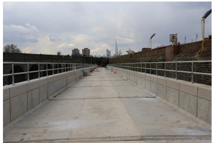
Finished deck ready to receive trackbed separated from restored arched railway viaduct