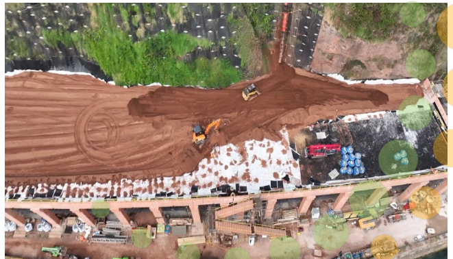
Deckdrain installed at the base of the cliff and onto the rockfall shelter roof and covered with red sand / soil mix