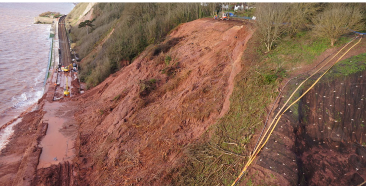
Land slide onto The South Devon Railway line following storms in February 2014

Local design, manufacturing and installation support service.