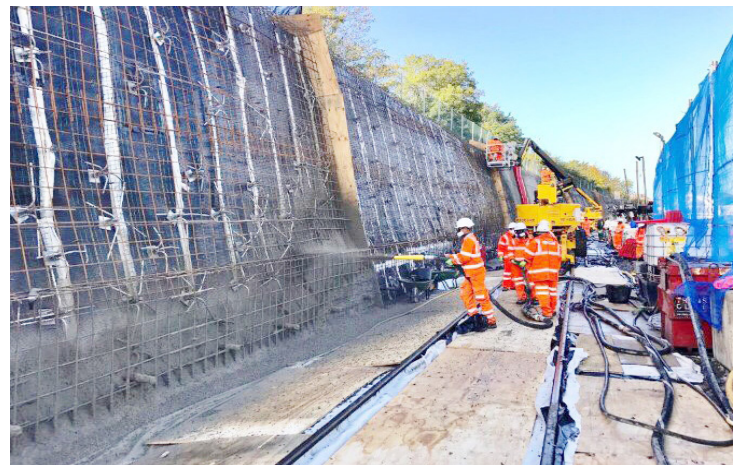
Deckdrain provides an impermeable skin for the drainage system, preventing ingress of concrete