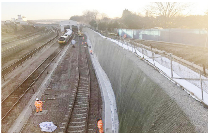
Finished retaining structure. The system using Deckdrain gained Network Rail engineer approval after trial