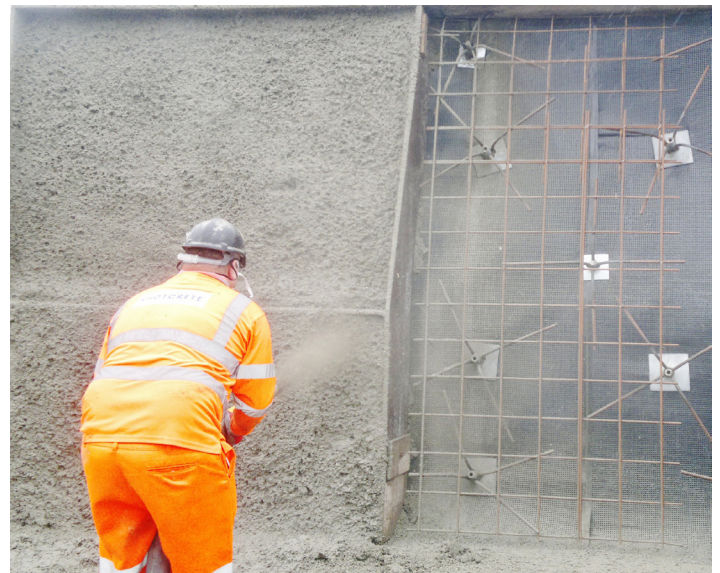
Installation trials demonstrated excellent adhesion of the sprayed concrete to Deckdrain

ABG provided design assistance and technical support during the design, trial and installation on this project.