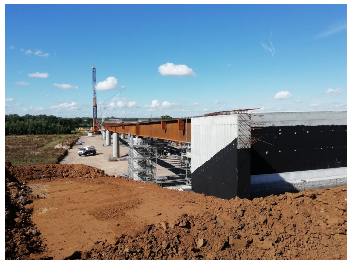
Site reported installation rates of up to 550m 2 per hour