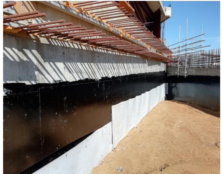
Easily and safely placed in cramped working conditions. Deckdrain provides protection to waterproofing from backfill operation

ABG provided technical support to aid product selection and gain approval from Highways England. ABG and the A14 Integrated Delivery Team entered the Deckdrain concept and were shortlisted for the Sustainability Category for the 2019 Construction News Awards .