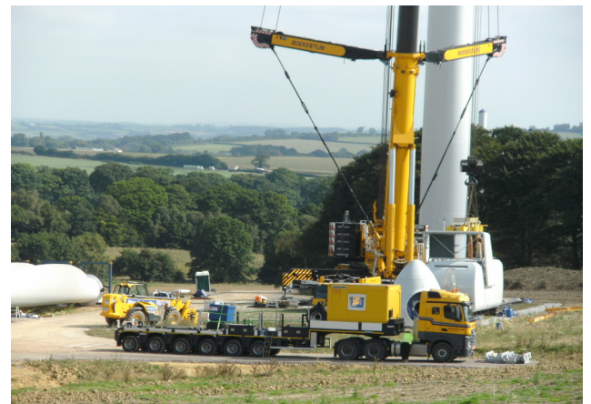
Truckcell provides a robust surface for lifting pads as well as running surfaces

ABG provided site specific input to the design and installation of each area. ABG also met a tight delivery schedule to minimise storage requirements on site, without delaying construction works.