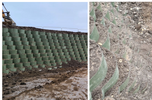
Type A panels to reach the retaining wall design height. Cells stepped back 100mm and filled with site won soils

Contact ABG today to discuss your project specific requirements and discover how our past experience and innovative products can help.