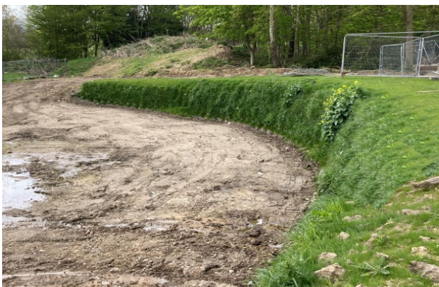
100m 2 of Webwall installed for the Priory View SuDS pond scheme

Slope stability calculations, design drawings and installation support were provided for the project.