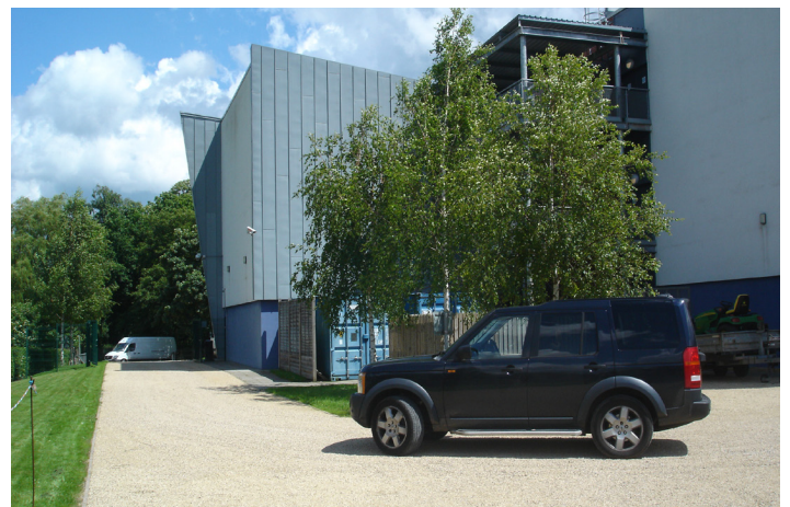
A porous and aesthetically pleasing finish