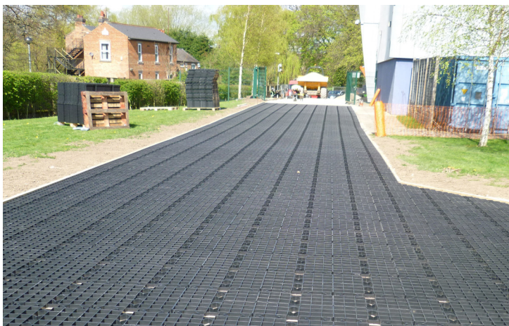
Sudspave clips together to form one interlocking system

The sublayers are built up from a prepared ground level overlain with a ABG Terrex geotextile then open Type 3 structural drainage subbase. Then an additional separator Terrex before placing a sand bedding layer to receive the ABG Sudspave 40 paving units. The units are pre-assembled together in sets of four to speed installation.