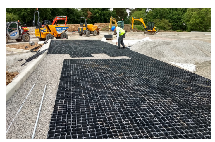
Supplied pre-assembled sets of four.