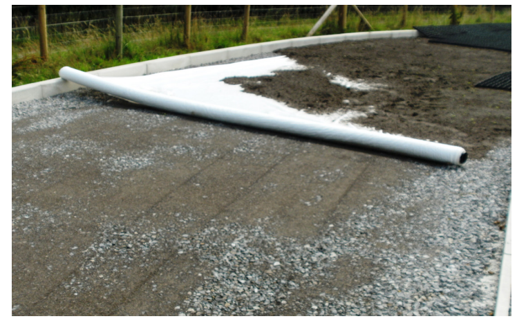
Rootzone bedding and cell infill promotes excellent grass growth.