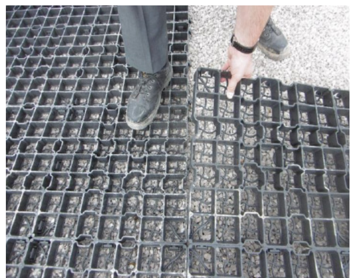
Easy to connect units with positive lug and slot.

ABG provided technical support during the tender period, and attended site to provide installation guidance. Deliveries were scheduled on a just in time basis to avoid filling valuable compound storage on site.