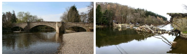
The former three arch stone bridge (left), washed away during Storm Desmond in December 2015 (right). The silty ground conditions prevalent on site required reinforcement prior to crane loadings.