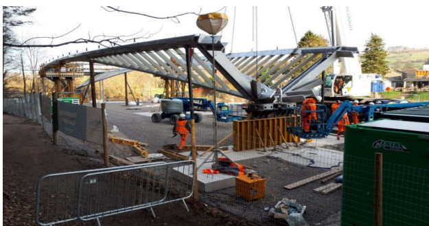
The steel span positioned ready for lifting on the working platform

In addition to the main platform design, ABG assisted with the compaction schedule in accordance to SHW 600, as well as providing drawing details for construction of the foundations around utilities and embankment areas.