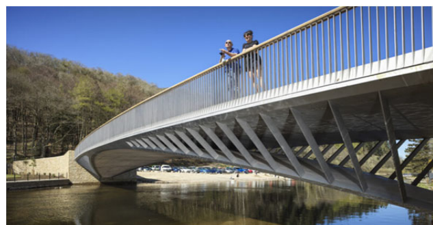
The new bridge in place with the working platform area suitable for car parking, visible in the background