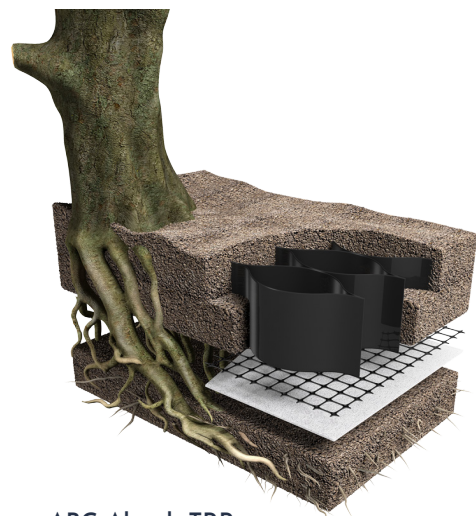
ABG Abweb TRP