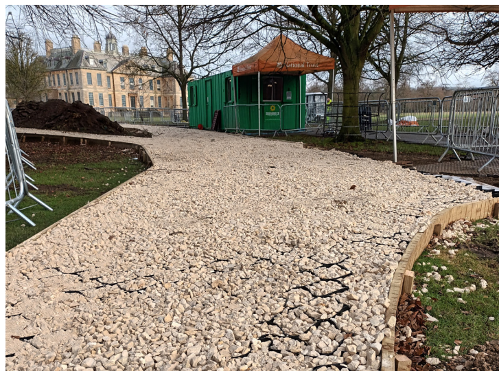
DTp Type 3 stone filled Abweb panels