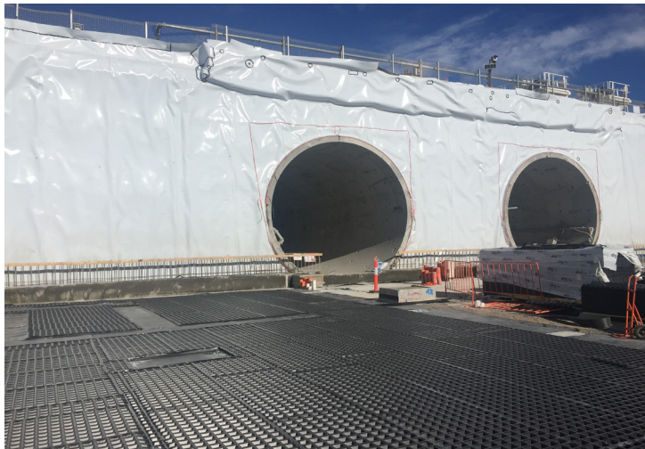
Installed panels of Cavidrain ready to receive concrete