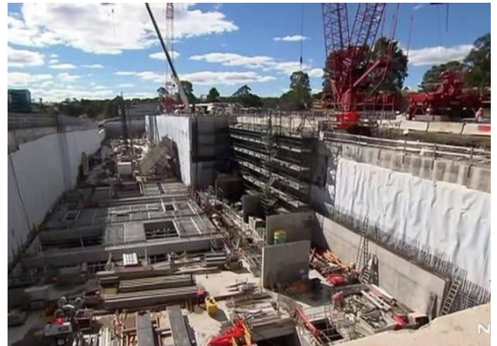
Ongoing construction after casting of floor slab