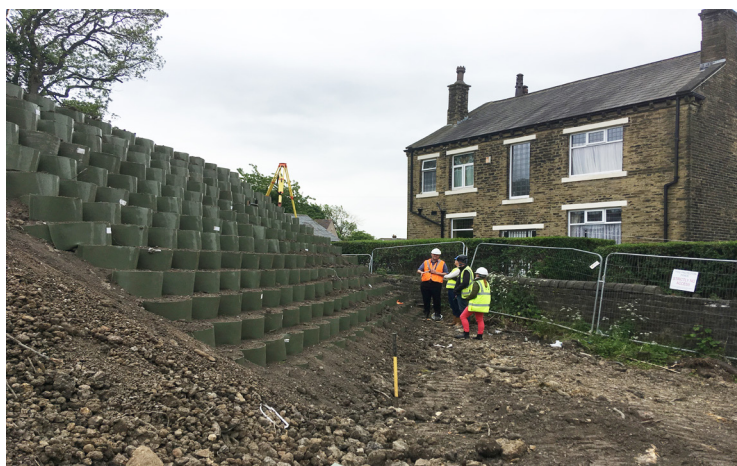
ABG gravity Webwall constructed around the constricted site boundary