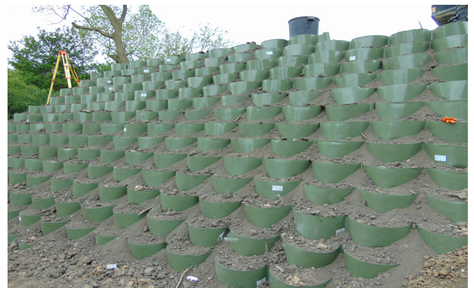
ABG gravity Webwall prior to planting and vegetation growth