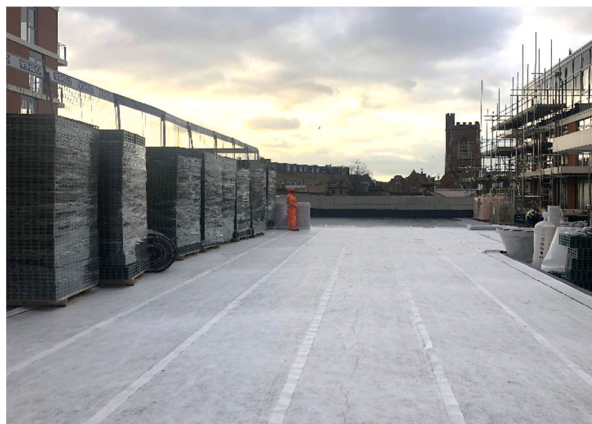
Roofdrain geocomposite installed above main attenuation voids on the green roof areas

ABG provided a full technical solution from design to manufacture, supply and installation of the blue and biodiverse roof systems.