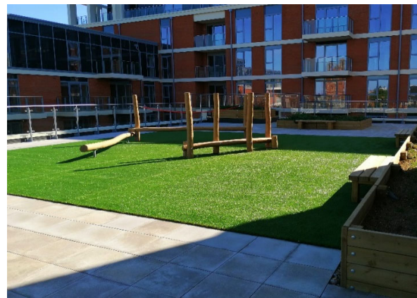
ABG's versatile bluroof system adapted to suit a range of roof finishes

Contact ABG today to discuss your project specific requirements and discover how ABG's past experience and innovative products can help.