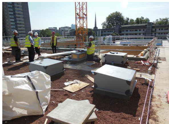
Biodiverse roof area during construction. Incorporated to enhance site ecology, contributing to the project achieving a BREEAM 'Excellent' Rating

ABG provide a full technical solution from design to manufacture, supply and install of the blue and biodiverse roof systems.