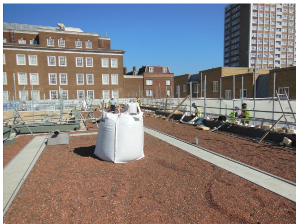
Pathways installed to make the roof accessible to all