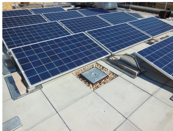
ABG's versatile bluroof system adapted to suit a range of roof finishes

Contact ABG today to discuss your project specific requirements and discover how ABG's past experience and innovative products can help.