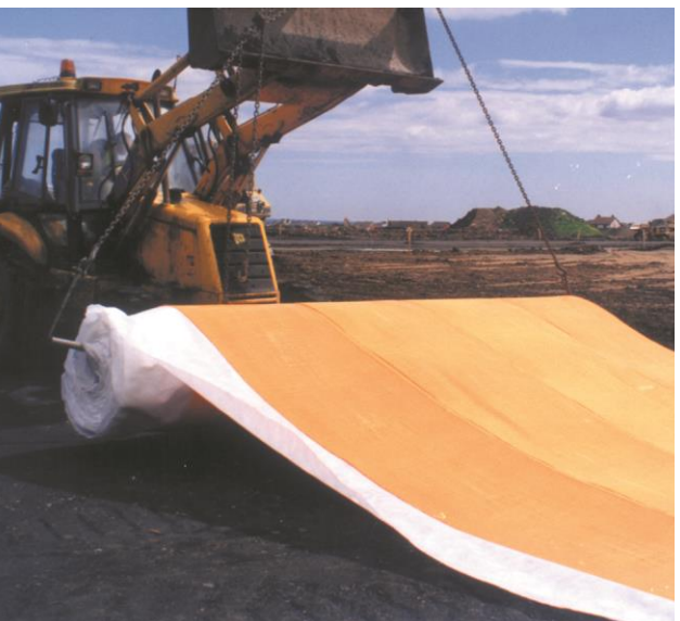
Pozibreak being installed in 4.4m wide rolls