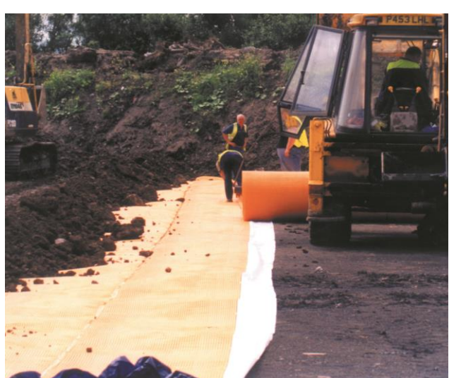
Overlapping Pozibreak rolls to form a continuous layer

ABG provided technical support and manufactured a bespoke solution to reduce the overall project costs.