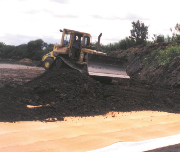
Clay layer placed on Pozibreak

Contact ABG today to discuss your project specific requirements and discover how ABG past experience and innovative products can help on your project.