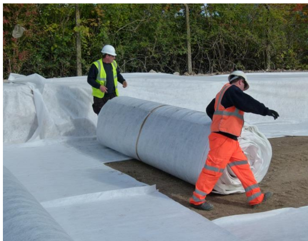
Fildrain Geocomposite drain installation.

ABG provided technical advice and design assistance.