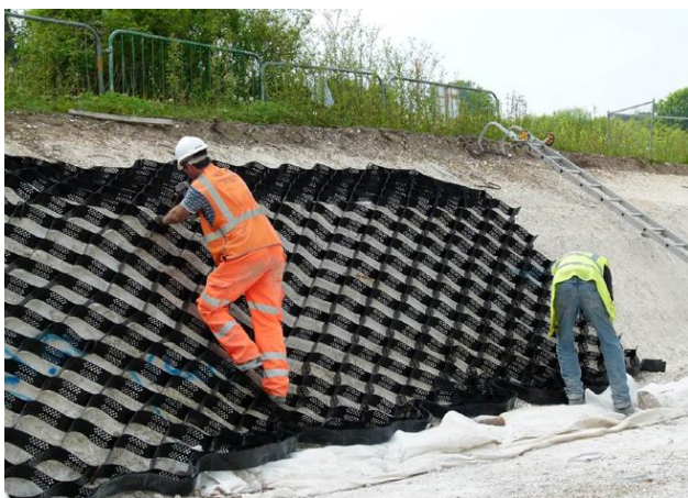
Erosaweb panels installation