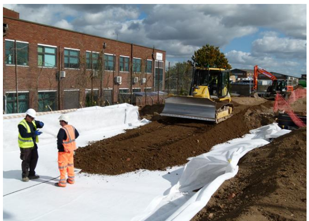
Fildrain covered prior to installation of trunk sections

Contact ABG today to discuss your project specific requirements and discover how ABG's experience and innovative products can help on your project.