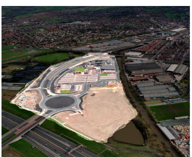
Saturated arisings from M60 cutting stockpiled and used in highlighted area with Fildrain reducing consolidation time by 80%

ABG provided full technical support to propose and gain approval from the various authorities for the use of Fildrain 7DD . Deliveries were coordinated to fit the work schedule to avoid stockpiling on a tight site.