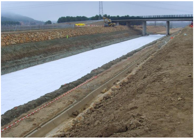
Wide width rolls allowed rapid installation to meet challenging project timescales

Contact ABG today to discuss your project specific requirements and discover how ABG past experience and innovative products can help on your project.