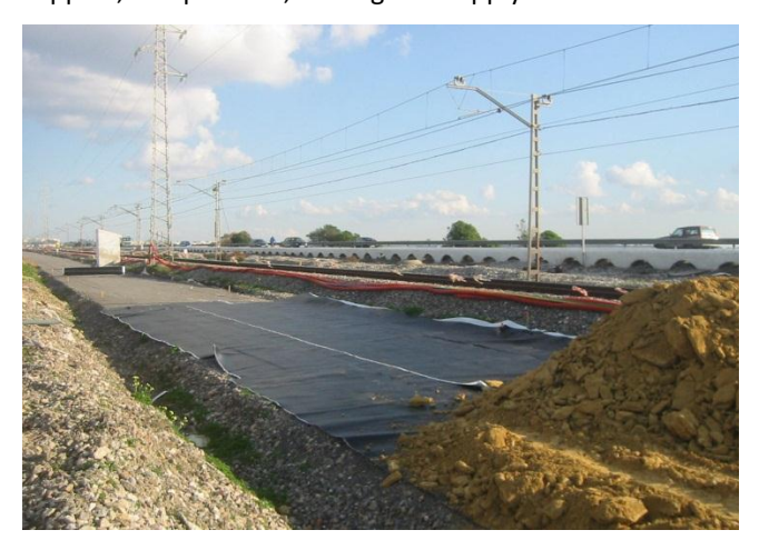
Embankment fill being installed on Pozidrain

ABG worked closely with Terratest to provide full design support, comparisons, costing and supply.