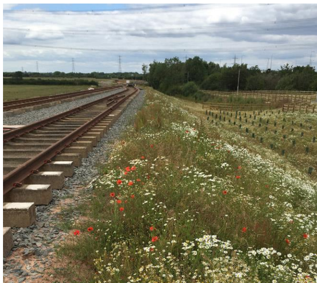
Erosamat supporting wildflower and grass growth