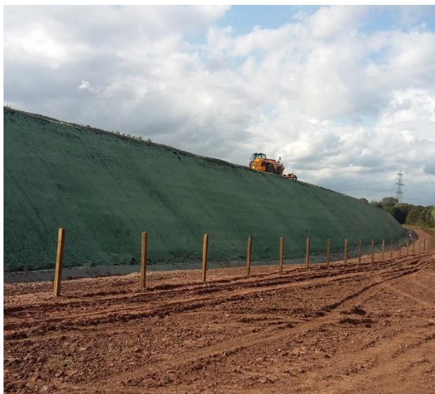
Hydroseeded Erosamat erosion control system

Contact ABG today to discuss your project specific requirements and discover how ABG past experience and innovative products can help on your project.