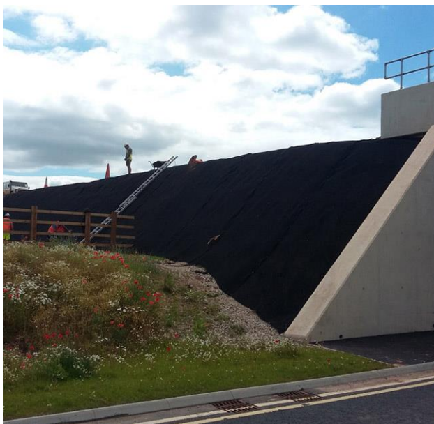
Erosamat 3/20Z500 installed on railway embankment

ABG provided technical advice and design assistance.