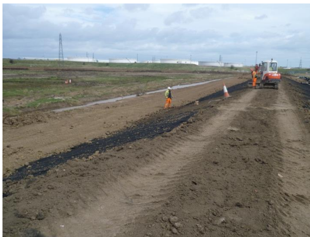
Topsoil filling of Erosamat

ABG Provided full specification and design support to aid the approval process.