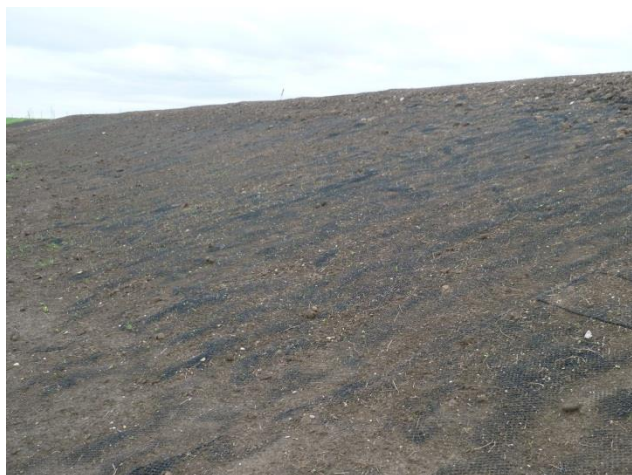
Early retention of soil and seeds encouraging early germination