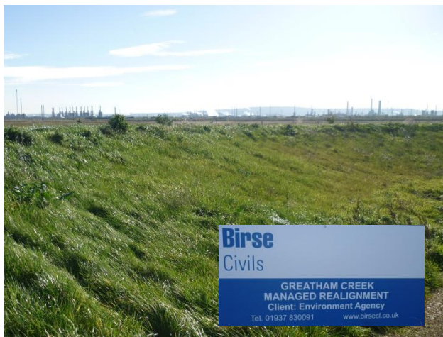
Composite root structure supporting healthy and sustainable vegetation

Contact ABG today to discuss your project specific requirements and discover how ABG past experience and innovative products can help on your project.