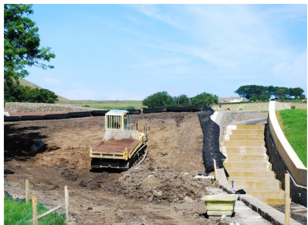
Steep slope with 6m/s design flow rates

Contact ABG today to discuss your project specific requirements and discover how ABG past experience and innovative products can help on your project.