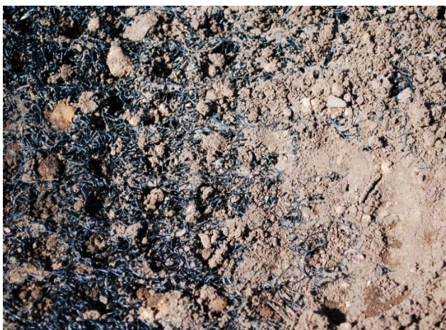
Erosamat's open surface area is easy to fill and promotes growth