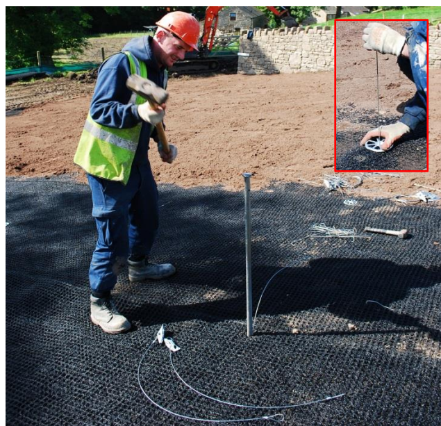
Ground anchors driven through soil. Washer placed over cable and tensioned against the geogrid.

ABG provided full technical design support for both the use of Erosamat and the fixing anchor regime to ensure the success of this project.