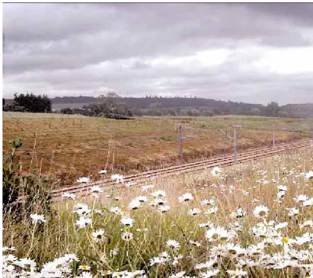
Natural flora and Fauna supported making minimum environmental impact on the chalk grassland

Contact ABG today to discuss your project specific requirements and discover how ABG past experience and innovative products can help on your project.